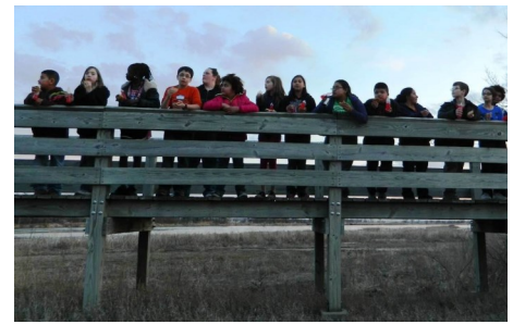
Platte River Sandhill Crane Trip March 2013

These programs and many others, including our great birdwatching field trips each month, are funded by the Birdathon. If you haven't contributed, please consider a contribution to Wachiska while it is still fresh in your mind. You can write a check for a flat amount, pledge a certain amount, say 40 cents, for each bird species our birders see on May 11 and 12 (see Birdathon letter), or you can donate on May 16 by participating in Give to Lincoln Day, as explained in the article on page 2.