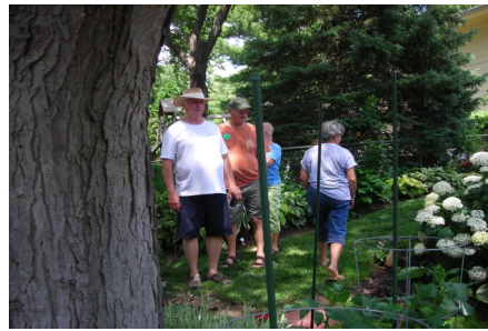
Backyard Habitat Tour – Father's Day, June 2012