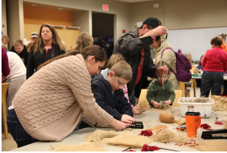
Bird enCOUNTER Day – Walt Library February 2013

Below are scenes of a few programs supported by your Birdathon donation. A new program called Bird enCOUNTER, created last year by the population and environment committee, was again a success in February. Designed to interest young people and their parents in birds and birdwatching, over 600 kids and parents participated at the branch libraries. Raptor Recovery Nebraska gave programs that included live hawks and owls. Kids made birdfeeders, binoculars, and nesting packages while learning the basics of birdwatching.