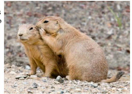
Do these look like weeds?

Sheridan County's Board of Commissioners is the first in Nebraska to adopt a management plan to prevent the expansion of black-tailed prairie dog colonies from the owner's land to adjacent property if the owner of the adjacent property objects to prairie dogs coming on their land.